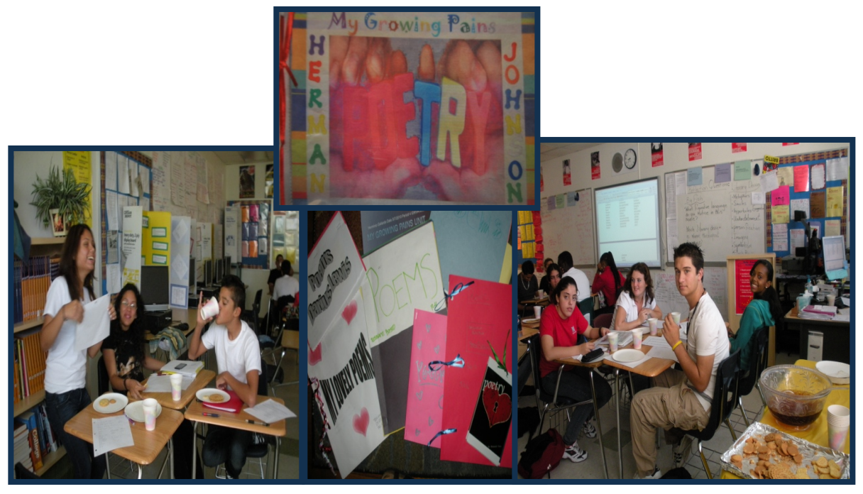
Sharing tea and biscuits while constructing group poems and students' personal booklets of poems

School Telephone: (305) 532-4515, ext. 2356 School Fax: (305) 531-9209