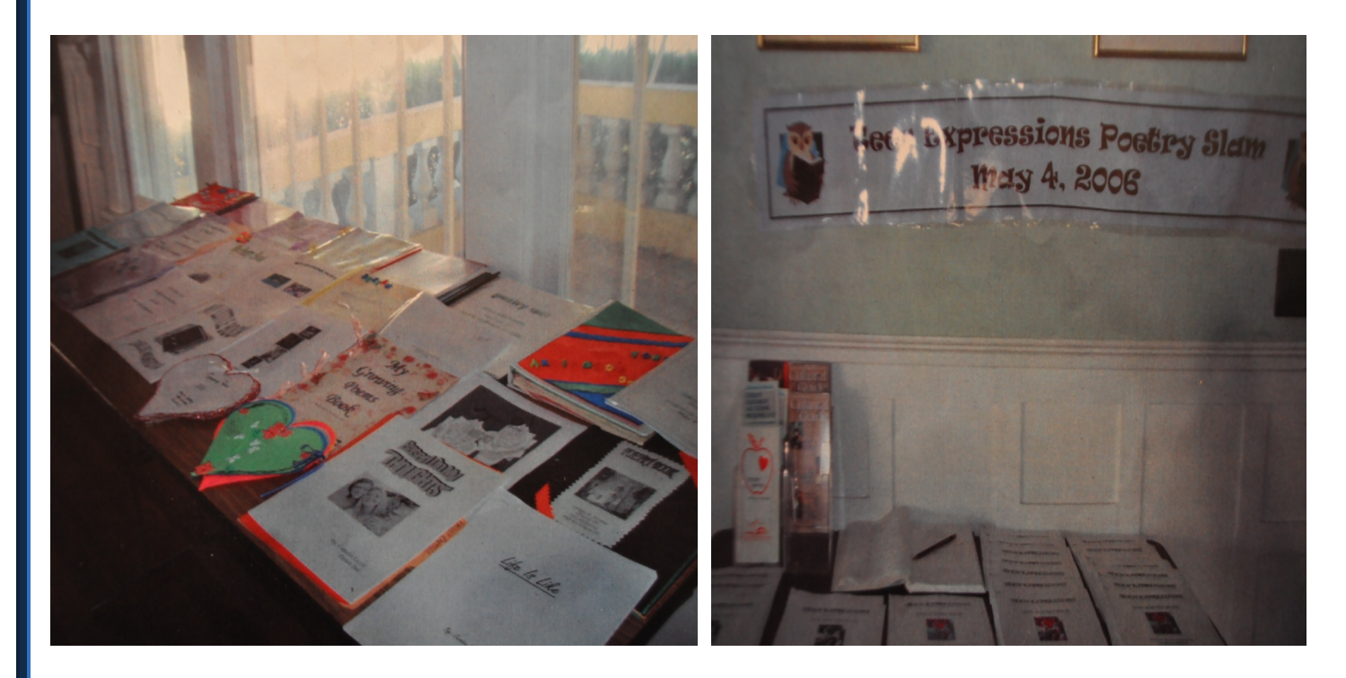
Students' Personal Booklets of Poems (above) /Class Anthology of Poems/Poetry Slam Program and Memento of Poetry Slam Event (below)